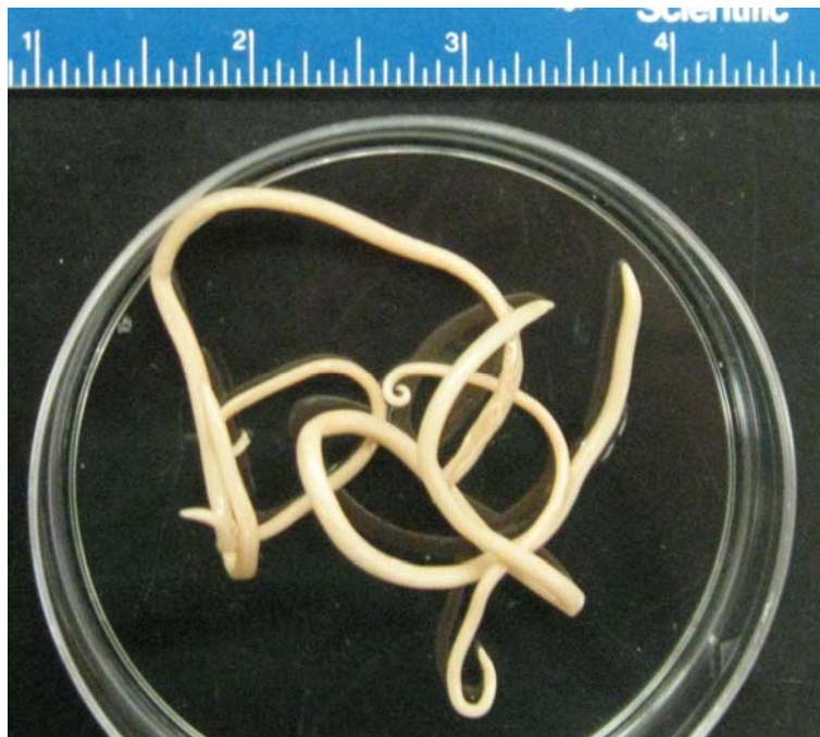
Figure 2: Adult Baylisascaris procyonis worms from the small intestine of a raccoon

B. procyonis is a large parasitic worm (9-20cm) that lives in the small intestine of raccoons. The worms can be white, beige, or tan in color (Figure 2). The worms grow and reproduce inside raccoon intestines without making them ill. Their microscopic eggs enter the environment through the feces of an infected raccoon. These eggs must develop in the environment for 10-14 days before they can infect a host.