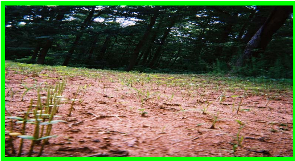
Figure 2. Heavily damaged (most plants were “browsed”) control plot on Day 9 after soybean emergence.