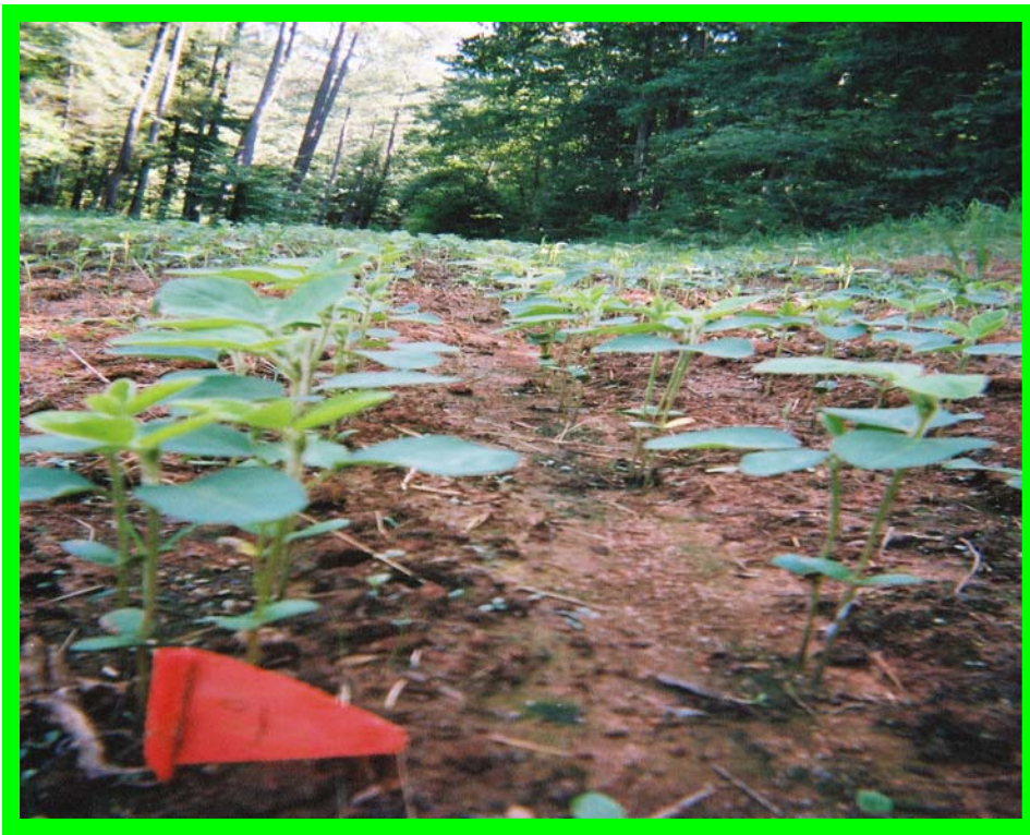
Figure 3. Undamaged (“unbrowsed”) soybean food plot at 9 days after soybean emergence following Milorganite treatment.