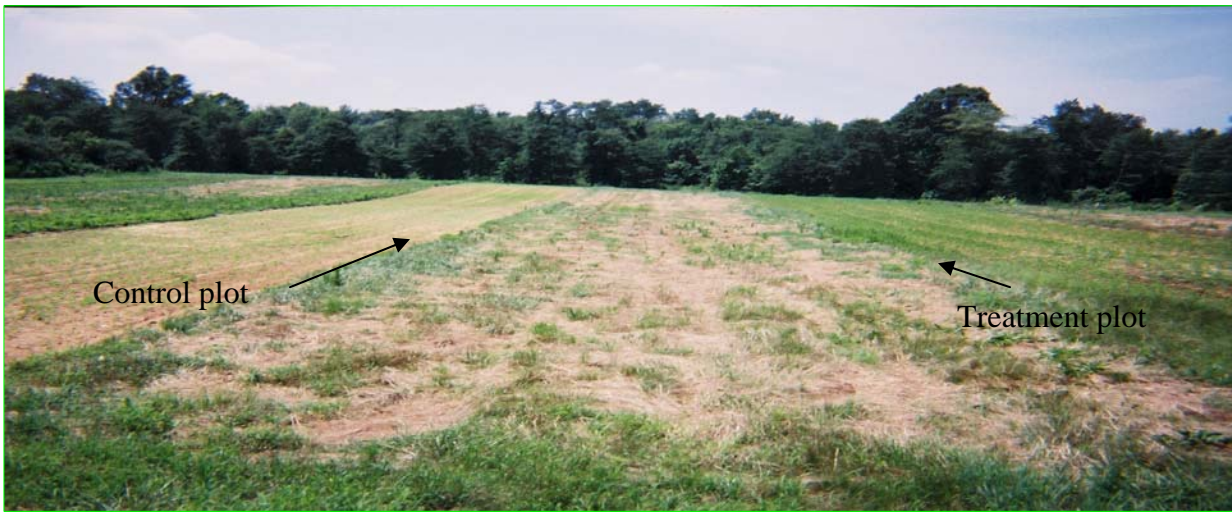
Figure 1. At each of 5 north Georgia properties, 2 - 0.5 ac food plots (control on left and treatment on right) were established with 15-300 m of natural vegetation separating the plots.