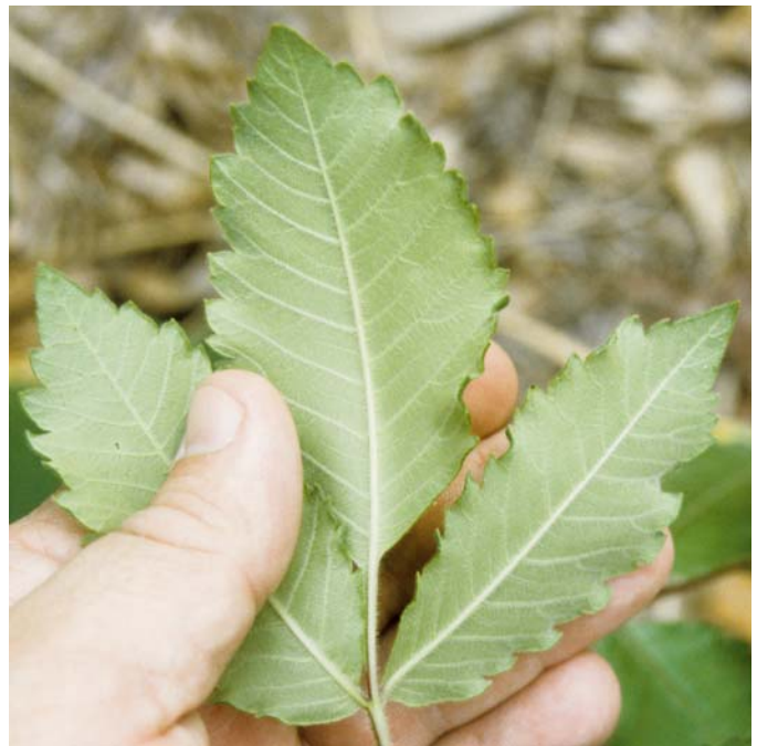
Leaves and leaflets.